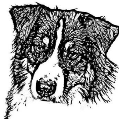
High Plains Aussie Club

(ASCA Sanction of these events is pending)